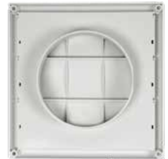
MV200 - Front